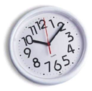
Daylight Savings Time Begins March 8, 2020