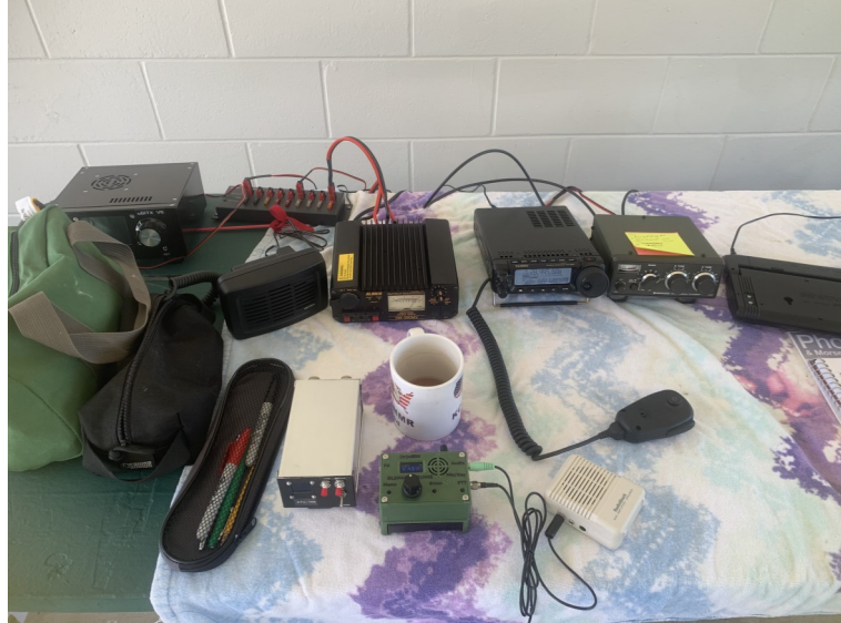
The GOTA station was super busy as a place many of our visitors stopped by to check out what was used for field communications. Rodney Clark's (KC4MMR) mini QRP rig was the star of the show!